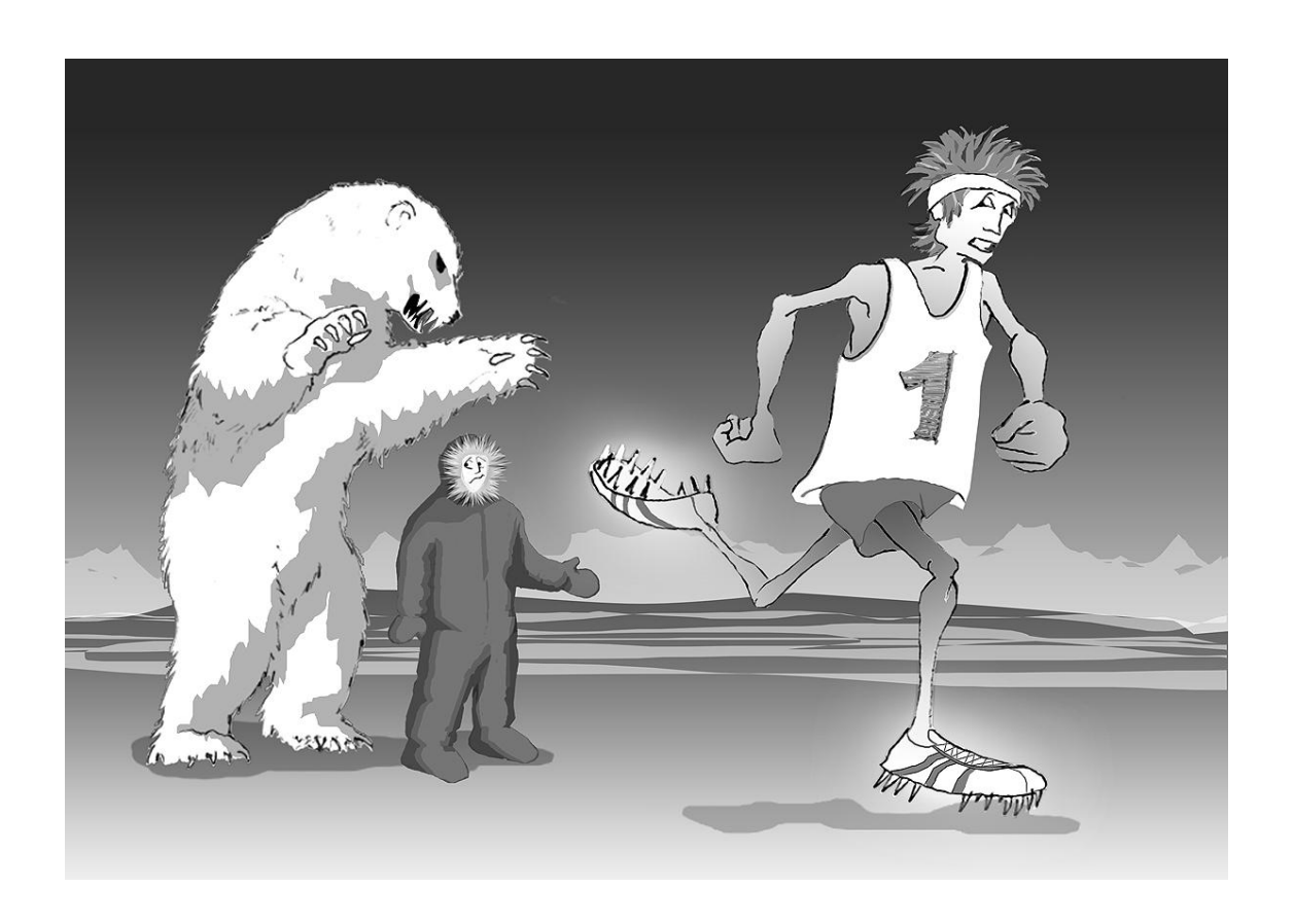
Fig 2. Two polar bear researchers are on their way to Svalbard, and one of them bring spikes... his companion points out that it is not possible to outrun a polar bear... The other remarks "I only have to outrun you"...

Physical performance has been less important for the development of human behaviour. It was mostly brain "spikes" that selected ancestors. Those who had slightly blunter spikes were left on the evolutionary scrap heap. Our ancestors were only slightly better than their contemporaries. It is not necessary to be a genius when one is surrounded by mediocre contestants. Evolution is about being only slightly better, and consequently, nobody is perfect. The competition to win access to resources and mates has always been fought against those who are closest. Even the most attractive and talented have, throughout time, only performed barely better than their competitors. Therefore, all individuals of all species generally exhibit both large and small irregularities, variations, halfway solutions, failures and shortcomings, both physically and mentally. Let the history of the Svalbard researchers follow you throughout the book. It describes a principle that forms variation. Furthermore,